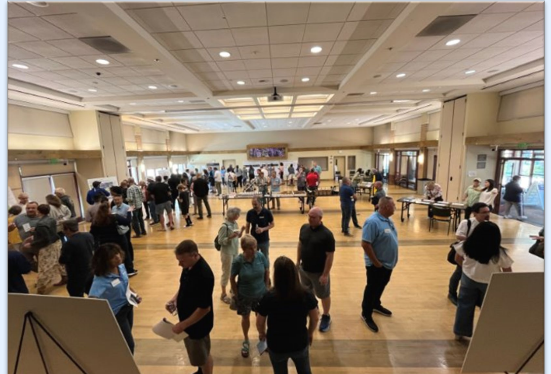
Brookfield's June Open House