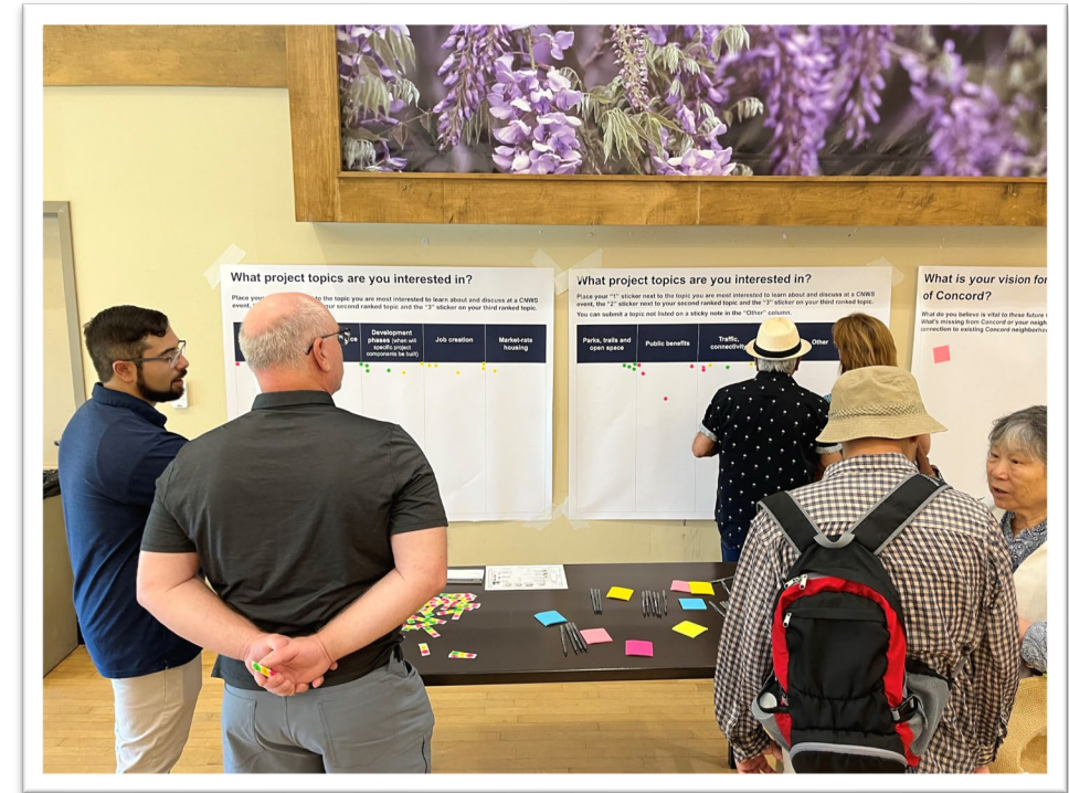
Brookfield CNWS Project Team member engaging with the community at an interactive station during the 6/15 CNWS Community Open House.