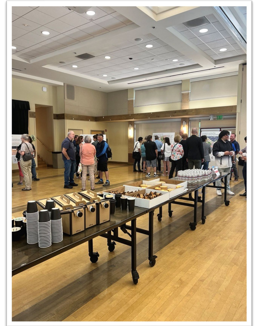
Local vendors displayed at open house refreshments table.